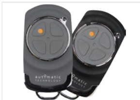
Two TrioCode™128 transmitters