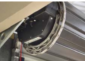
Weather Resistant Opener